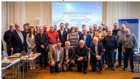
Delegates at the EGU Congress in Malmö

of EGU, it was possible to reduce annual fees as a onetime measure for Full Members by 30%. Our support to Ukraine continues also in this year with no fee for their membership.